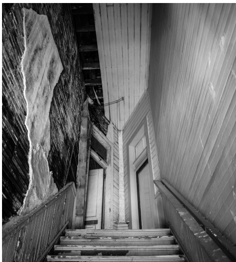
Stairs between 313 & 315 E. 3rd St.

From the Lampasas Heritage Foundation Inc.: We are thrilled that Lampasas native, Thomas Crawford, has purchased two fabulous historic 1800s buildings at 311 and 313 East Third Street! Both buildings hold a lot of memories for him growing up in Lampasas. In 1885, the corner building served as a barber shop while the building next to it was a hardware store with a tin shop in the back and offices on the second floor. By 1896, the corner building was extended to the back alley, with a hardware store in the front and a tin shop in the back. Needless to say, many people remember that Medinas at one point served up enchiladas here, it was a steak house, and a German restaurant. There is a lot of history to rebuild, but Thomas is starting by removing a massive amount of junk (and maybe a few treasures) from both buildings. After that he will be replacing the roof which currently allows rainwater to pour into the building followed by replacing all of the windows, most of which are broken or missing. We look forward to keeping you updated as another piece of Lampasas history comes back to life.