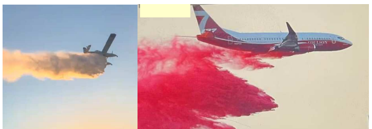
Aerial drops at the Spotted Opossum Fire on Lampasas CR 3900 8-16-23