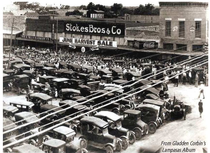
From Gladden Corbin's Lampasas Album

(Picture courtesy of Gladden Corbin's Lampasas Album and The Lampasas Heritage Foundation)